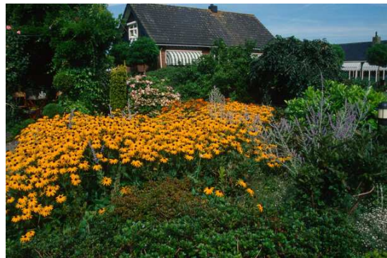
Left: Perennials are very important to stimulate biodiversity in our parks and gardens